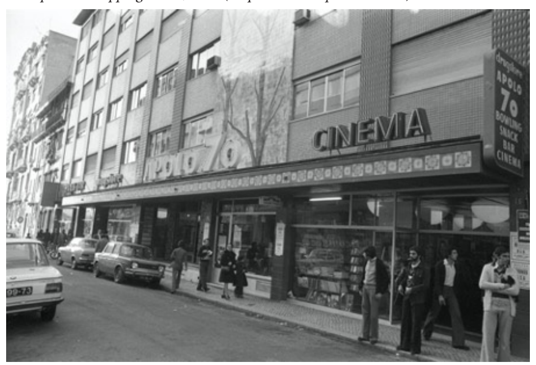
Figure 2 The Apolo 70 shopping centre, 1977

Meanwhile, with the opening of each successive shopping centre, Lisbon's urban landscape was becoming increasingly fragmented. For centuries, the city's baixa district, with its grid-patterned streets and smart Pombaline architecture, had served as its main commercial hub. But a mixture of neoliberal reforms, combined with