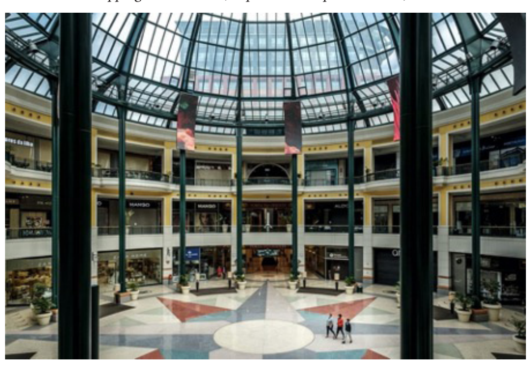
Figure 3 The Colombo shopping centre, 2020

the increasing prominence of the private property market, as well as a lack of intermunicipal cooperation, resulted in a process of sprawling suburbanisation and the emergence of multiple, geographically dispersed commercial centres (Lund Hansen, 2003; Tulumello, 2015). Between 1991 and 2011, Lisbon's city centre lost over a third of its population, while the broader metropolitan region gained over 300,000 new residents (Lestegás, 2019). Arguably, this process of urban restructuring (culminating in major urbanisation projects such as EXPO '98 and the POLIS Programme) marked the emergence of what Manuel Castells ominously calls "the Wild City," later reformulated by Edward Soja as the "post-metropolis," a bewildering new reality in which "the contemporary city seems to be increasingly unmoored from its spatial specificity, from the city as a fixed point of collective reference, memory and identity" (Castells, 1977, p. 427; Soja, 2000, p. 150). By the turn of the new millennium, shopping malls such as Amoreiras had largely overtaken "traditional" shopping streets as Lisbon's principal commercial spaces.